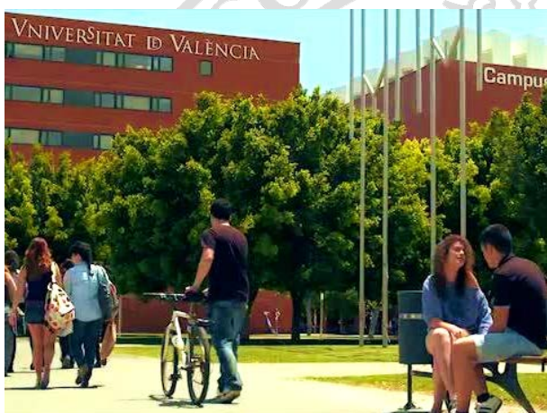
One of our three campuses