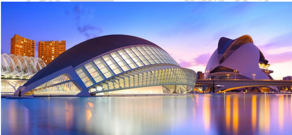
The City of Arts and Sciences, one of the many attractions in the city of Valencia

Applications welcome at any time. For the deadline, please consult the coordinators of each language.