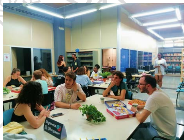
One of our language learning centres